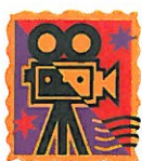
Photo day is approaching on Thursday 28 th November . Please remember each child must have their own separate envelope with them, at the time that their photo is being taken. Please ensure students are wearing school uniform.

If anyone would like a family photograph, we have separate family envelopes that can be collected from the office.