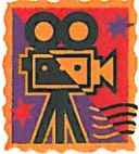
Photo day is approaching on Thursday 28 th November . Please remember each child must have their own separate envelope with them, at the time that their photo is being taken. Please ensure students are wearing school uniform.

If anyone would like a family photograph, we have separate family envelopes that can be collected from the office.