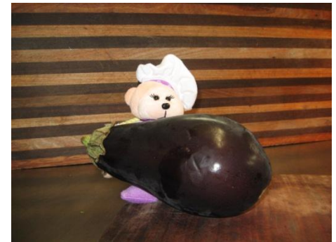
Lots of vegies with Haylee