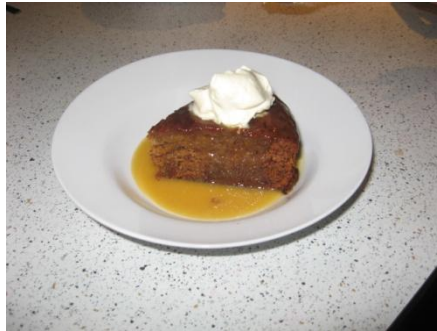
Sticky Date Pudding with Ashlyn