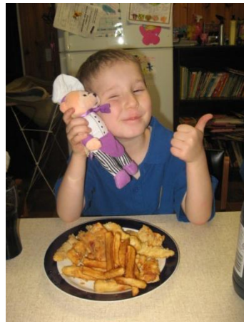
Kev's famous Fish and Chips